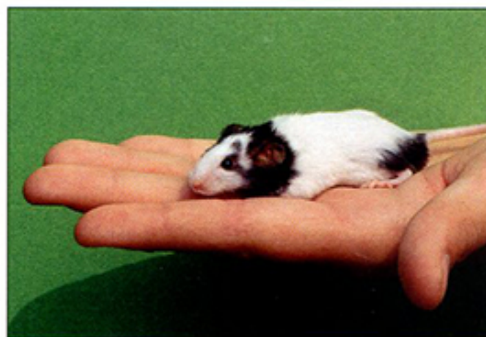
Above: A dance mouse.