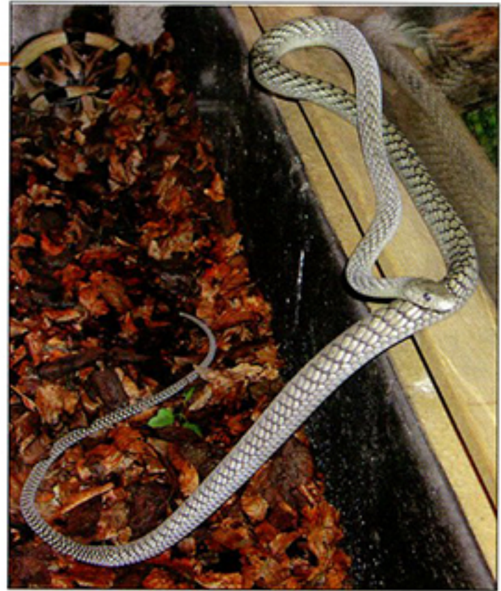
The Dangerous Green Mamba.