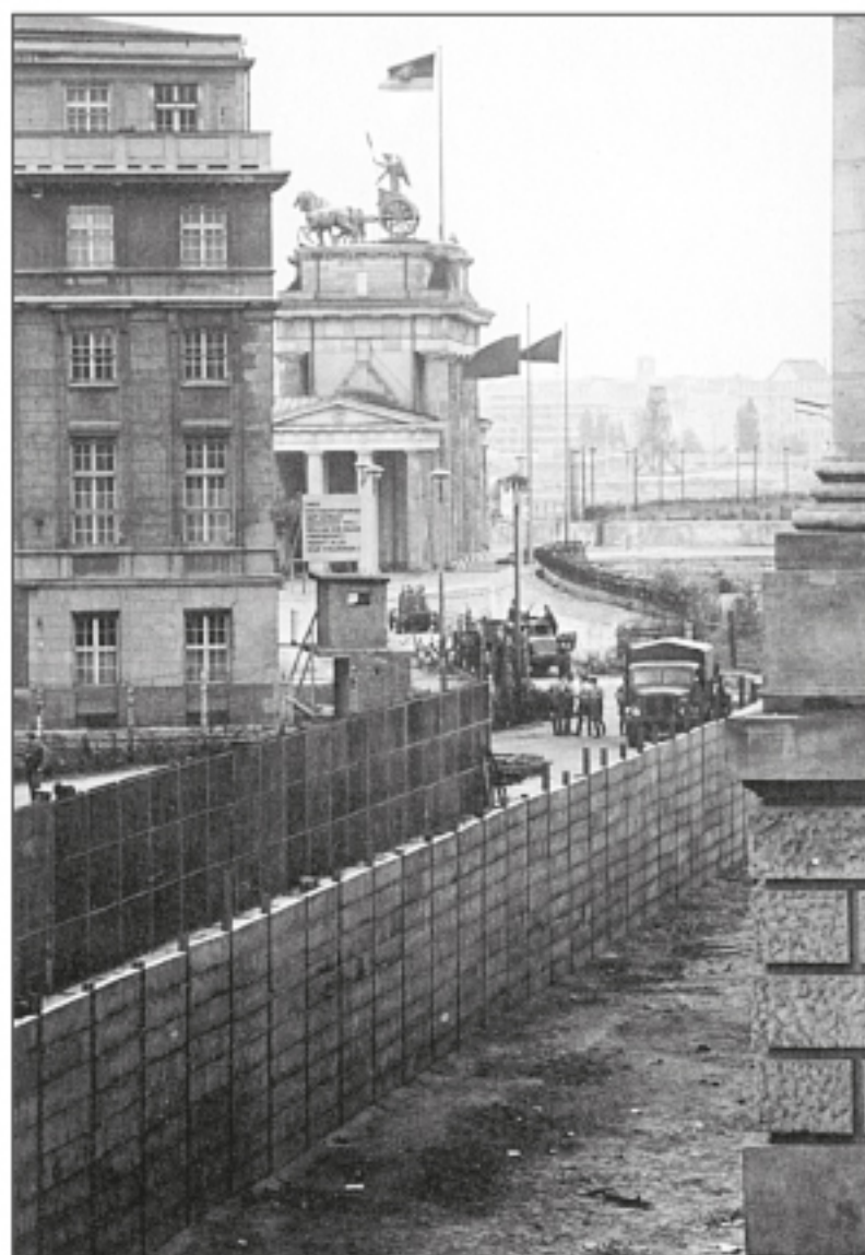
The first wall

There were watchdogs and watchtowers and a second wall.