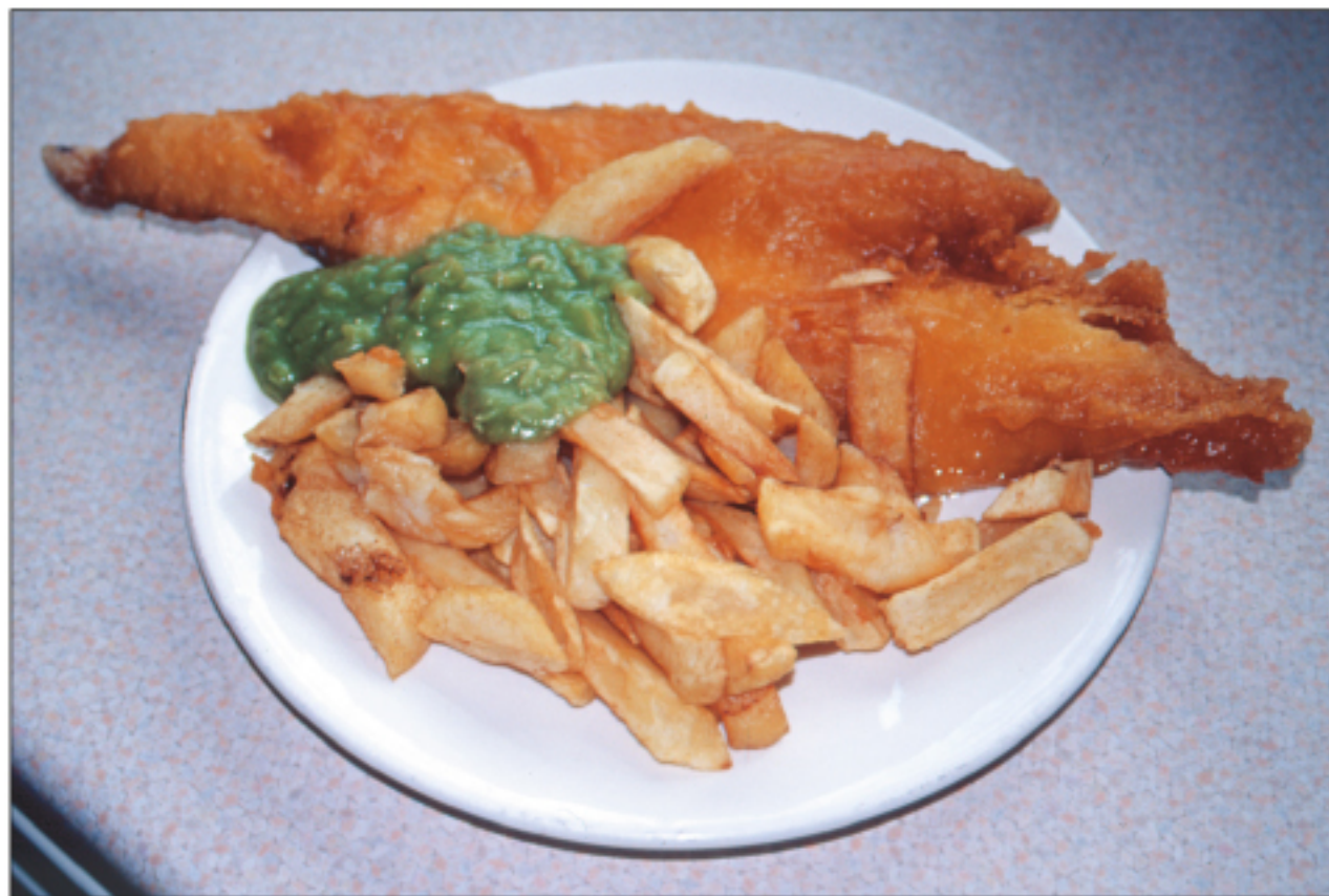
Fish and chips - a very English dish

The customs followed when serving food and the use of utensils also differ.